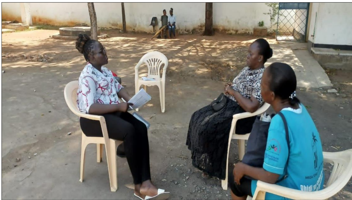
Images showing key informant interviews and focus group discussions in progress.